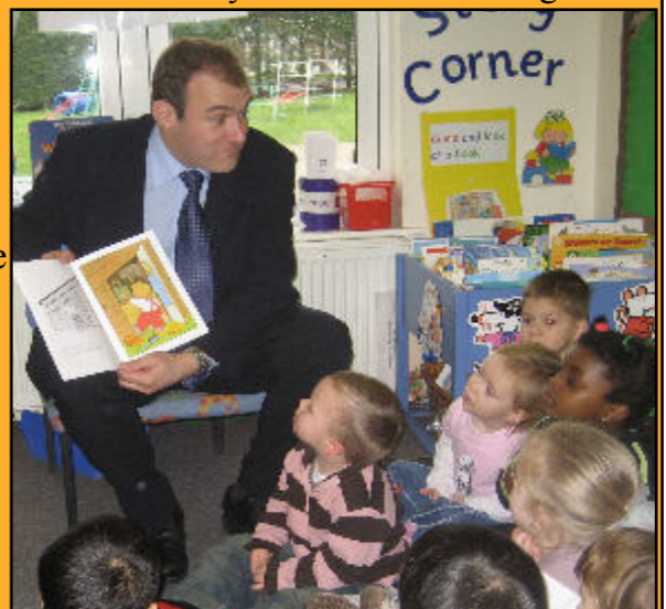
MP Edward Davey is concerned a future Government will cut funds to Kingston's schools and force class sizes for infants to rise again.

Conservatives had the largest class sizes in the country, with up to 40 in a class." Edward's work at Westminster confirms this is a London-wide problem. So he's working cross-party with councils and MPs as the best way to win cash for Kingston.